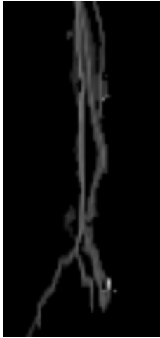
Figure 3. Three-dimensional reconstruction of the vasculature showing the pseudoaneurysm in relation to a small retained piece of hardware.

and it occurred at the division of the dorsalis pedis artery into the first metatarsal branch and arcuate artery. Symptoms of swelling and pain began on the dorsum of the foot 3 days after operation. Doppler ultrasound imaging revealed a dorsal first metatarsal artery pseudoaneurysm that housed a mural thrombus. The authors were able to excise and ligate the lesion with good results at 6-month follow-up.