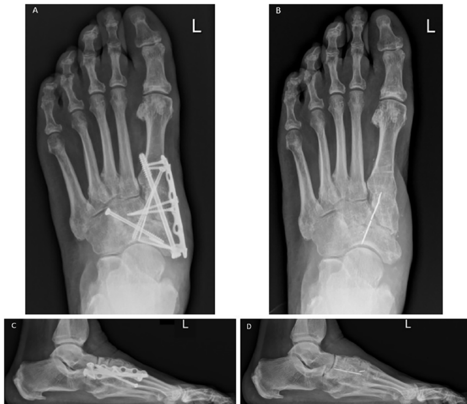
Figure 1. (A) Anteroposterior (AP) radiograph of the foot before removal of hardware; (B) AP radiograph after removal of hardware; (C) lateral radiograph of the foot before removal of hardware; (D) lateral radiograph after removal of hardware.