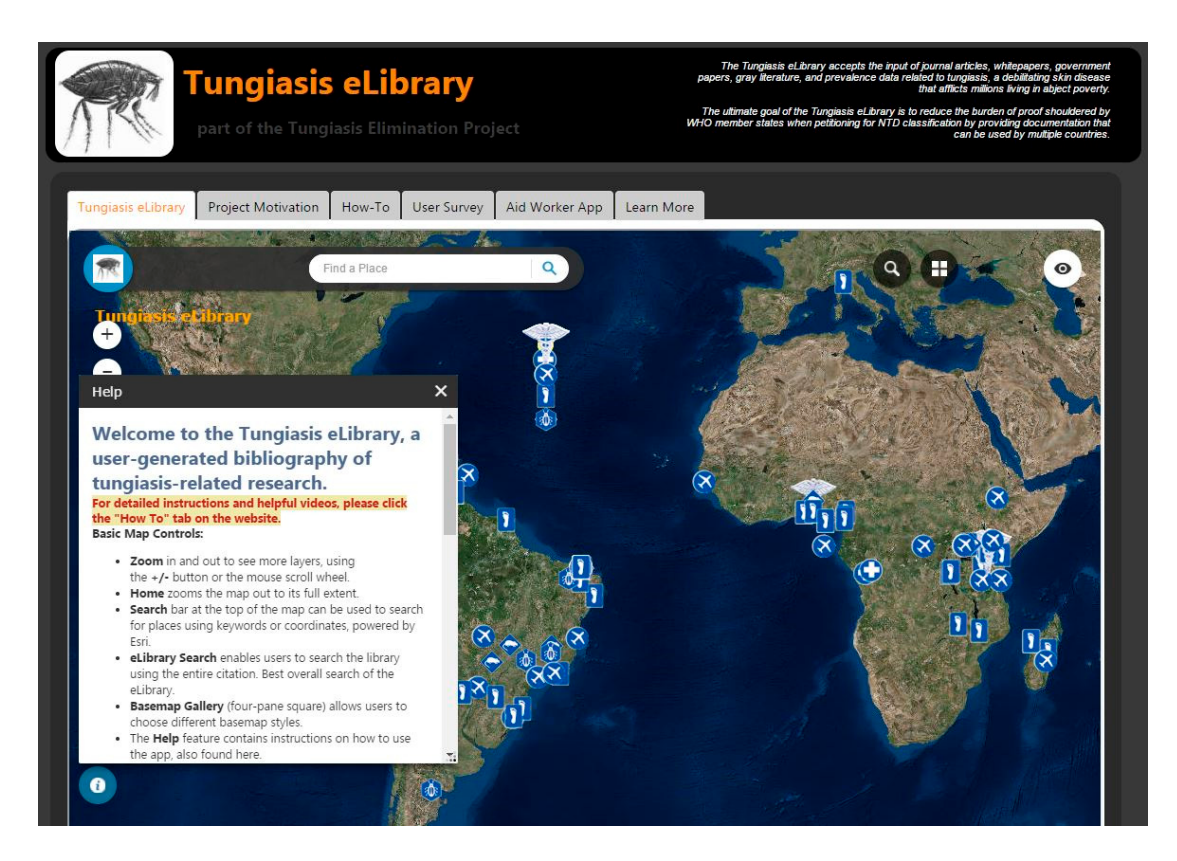
Figure 2. Screenshot of the Tungiasis eLibrary Application website.