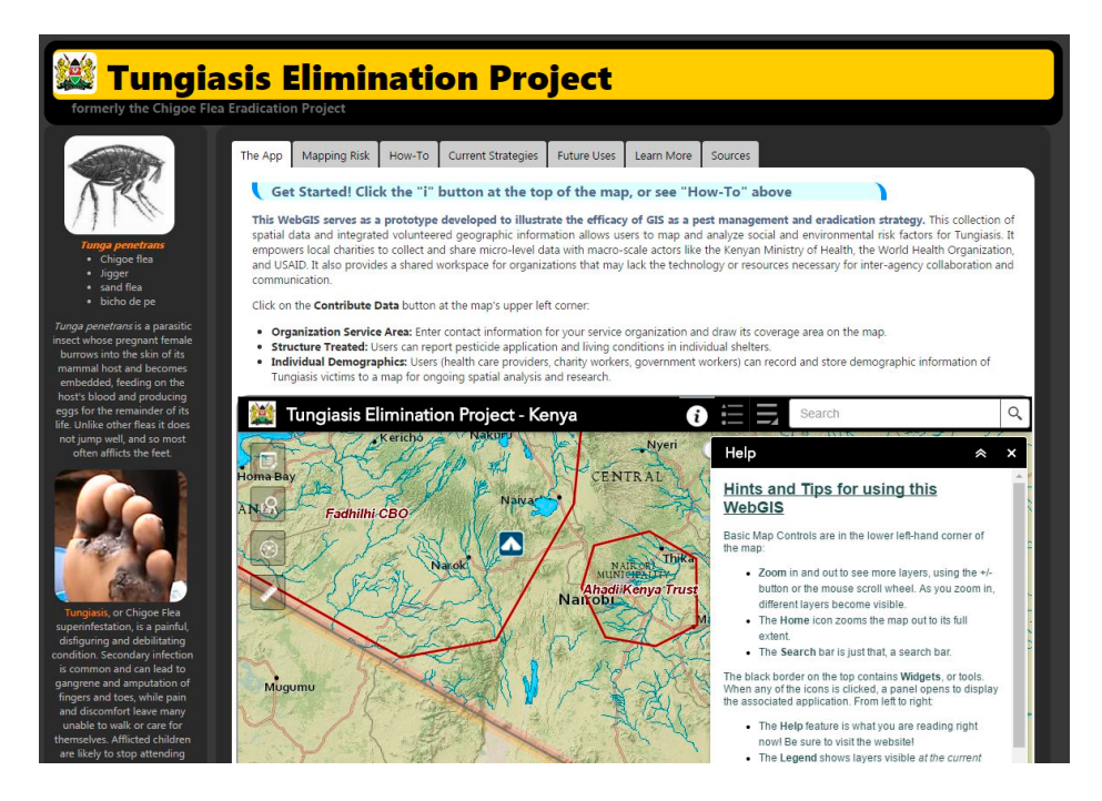
Figure 1. Screenshot of the Tungiasis Elimination Project Application Website.

Prior to Wright's study (2017), no VGI-based database developed specifically for WHO tungiasis reclassification existed, nor had a web GIS been proposed to house both georeferenced socioeconomic and epidemiologic data collected by aid workers and peer-reviewed publications. Thanks in large part to recent advances in web mapping technologies, it is now possible to provide standardized GIS workflows to multiple organizations battling the same disease across great distances. The Tungiasis Elimination Project (TEP) application, shown in Figure 1, serves aid workers and non-governmental organizations (NGOs) in developing strategies to manage tungiasis [63]. Future versions of the TEP will enable field data collection using readily available mobile mapping tools such as Esri's Collector for ArcGIS application, which can be augmented with a Bluetooth-connected global navigation satellite system receiver in areas where cellular service is not available.