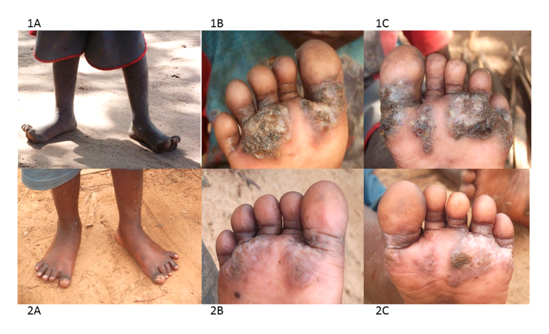
Figure 3. Photographs illustrating the impact of neem and coconut herbal medicine ontungiasis infection and pathology ( 1A–C before treatment; 2A–C after 5 applications).

shoes to all of the public and private primary and nursery schools in its area of operation. CHVs inspect the children's feet before they receive shoes and any found with embedded fleas are treated. The foot screening has been recorded to provide a simple method for monitoring the group's impact on tungiasis prevalence and intensity. Most distribution and screening was done in May–July, the wet season, and again in September–November, the dry season. Peak transmission is during the hot and dry season in December–March.