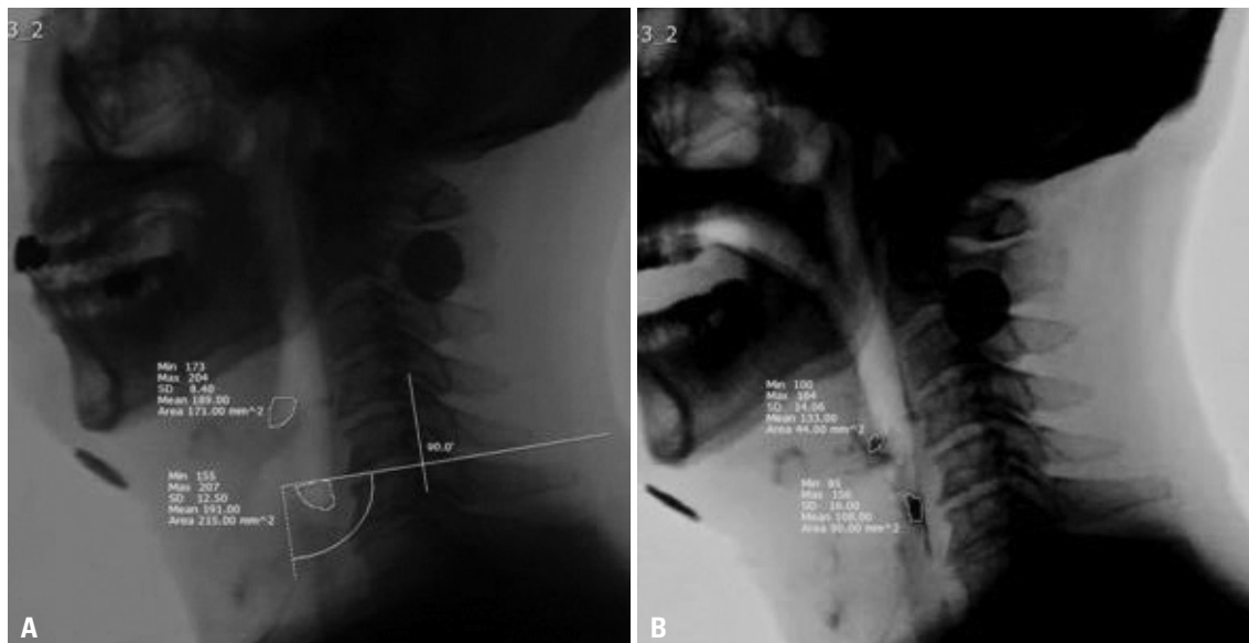
Fig. 2. Valleculae and pyriform sinus area (A) and post-swallow residue (B) measured using pixel-based circumscribed area ratios.