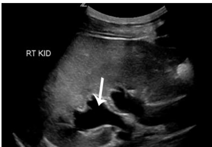
Figure 1. Longitudinal view of the right kidney showed moderate hydroureteronephrosis (arrow).

Chu et al 9 described 59 patients from two hospitals in Hong Kong with ketamine-associated cystitis. Fifty-one percent of these patients had unilateral hydronephrosis, while 44% had bilateral hydronephrosis. They report that most of these patients showed hydronephrosis and hydroureter that extended down to the vesiculo-uteric junction. It is postulated that upper