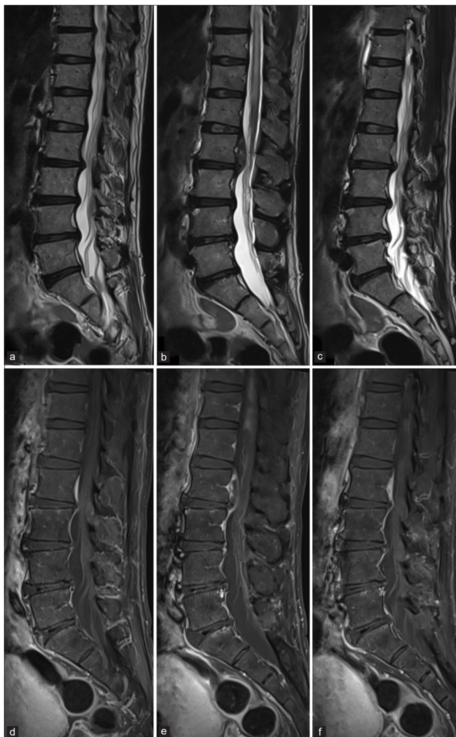
Figure 1: Magnetic resonance imaging of the lumbosacral spine. Sequential sagittal T2-weighted (a-c), and gadolinium-enhanced T1-weighted with fat saturation (d-f) images reveal abnormal hyperintense T2 signal with patchy enhancement representing spinal cord congestion extending from the conus medullaris to the thoracic level. There is a large L2–L3 disc sequestration with superior migration along the posterior aspect of the L2 vertebral body, compressing dura resulting in moderate spinal canal stenosis. This sequestered disc appears isointense T1, slight hyperintense T2 to disc space with peripheral enhancement. In addition, associated diffuse thickening, clumping with enhancement of the cauda equina roots are noted, probably representing arachnoiditis.

We described a case of FTAVF in association with a large lumbar sequestered disc and arachnoiditis. The pathogenesis of the fistula in this situation was discussed.