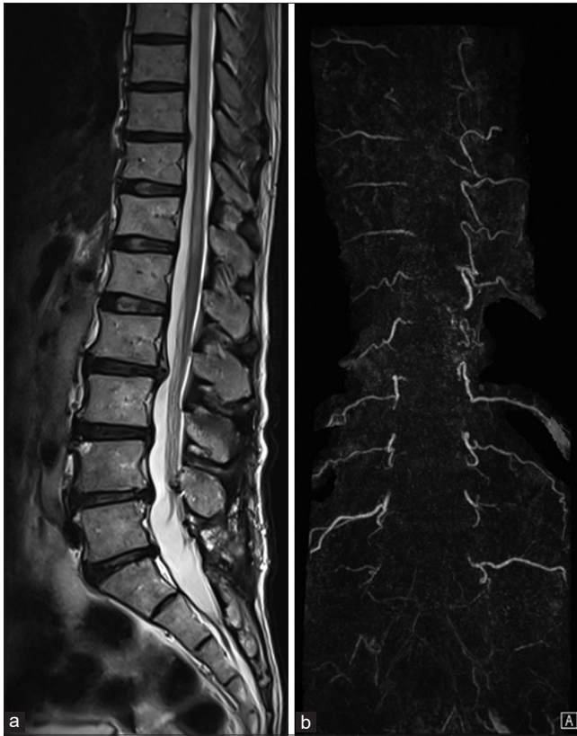
Figure 5: (a) Sagittal T2-weighted image of the thoracolumbar spine obtained 4 months after the operation reveals significant resolution of spinal cord congestion. Spontaneous resorption of the large sequestered L2–3 is noted. (b) Contrast-enhanced magnetic resonance angiography of the thoracolumbar spine confirms complete obliteration of the fistula