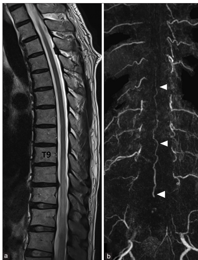
Figure 2: (a) Sagittal T2-weighted image of the thoracic spine demonstrates spinal congestion extending from the conus medullaris to the level of T9. (b) Contrast-enhanced magnetic resonance angiography of the thoracolumbar spine shows tortuous and enlarged intradural vessels (arrowheads) in the midline location extending from the lower lumbar level to the mid-thoracic level

had no history of any injury. The patient went to the local medical center and was treated with some medicines and physiotherapy. One month before hospitalization, he was only able to walk approximately 100 m before needing to stop. Two weeks before admission, he developed urination incontinence requiring diapers. The patient was transferred to our institute and admitted for further investigation. On physical examination, his gait was slightly wide based. The straight leg raise test was negative. The neurological examination revealed the evidence of spastic paraparesis (muscle strength 4/5), impairment of proprioception, hyperreflexia, and presence of Babinski sign in the lower extremities. MRI of the lumbosacral spine revealed abnormal hyperintense T2 signal with patchy enhancement representing spinal cord congestion extending from the conus medullaris to the level of T9. There was a large, sequestered disc fragment came from L2-L3 disc herniation migrated cranially along the posterior aspect of the L2 vertebral body, compressing dura resulting in moderate spinal canal stenosis. This sequestered disc appeared isointense T1, slight hyperintense T2 to disc space with peripheral enhancement. In addition, associated diffuse thickening, clumping, and enhancement of the cauda equina roots were noted, probably representing arachnoiditis [Figures 1a-f and 2a]. Contrast-enhanced