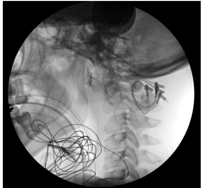
Fig. 2. Fluoroscopic intraoperative image showing failed closed reduction.

The patient’s neck was then prepared and draped, and a midline subperiosteal approach was performed with sharp dissection and bipolar electrocautery to avoid monopolar contact with the C1–2 cables. With the cervical spine exposed from the occiput to C3, laminectomy of C1 and C2