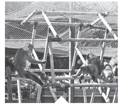
NONHUMAN PRIMATES USED IN MEDICAL RESEARCH

Monkeys are often involved at the later stage of the process what is called translational or applied research. Here all of the knowledge accumulated earlier is applied to specific medical