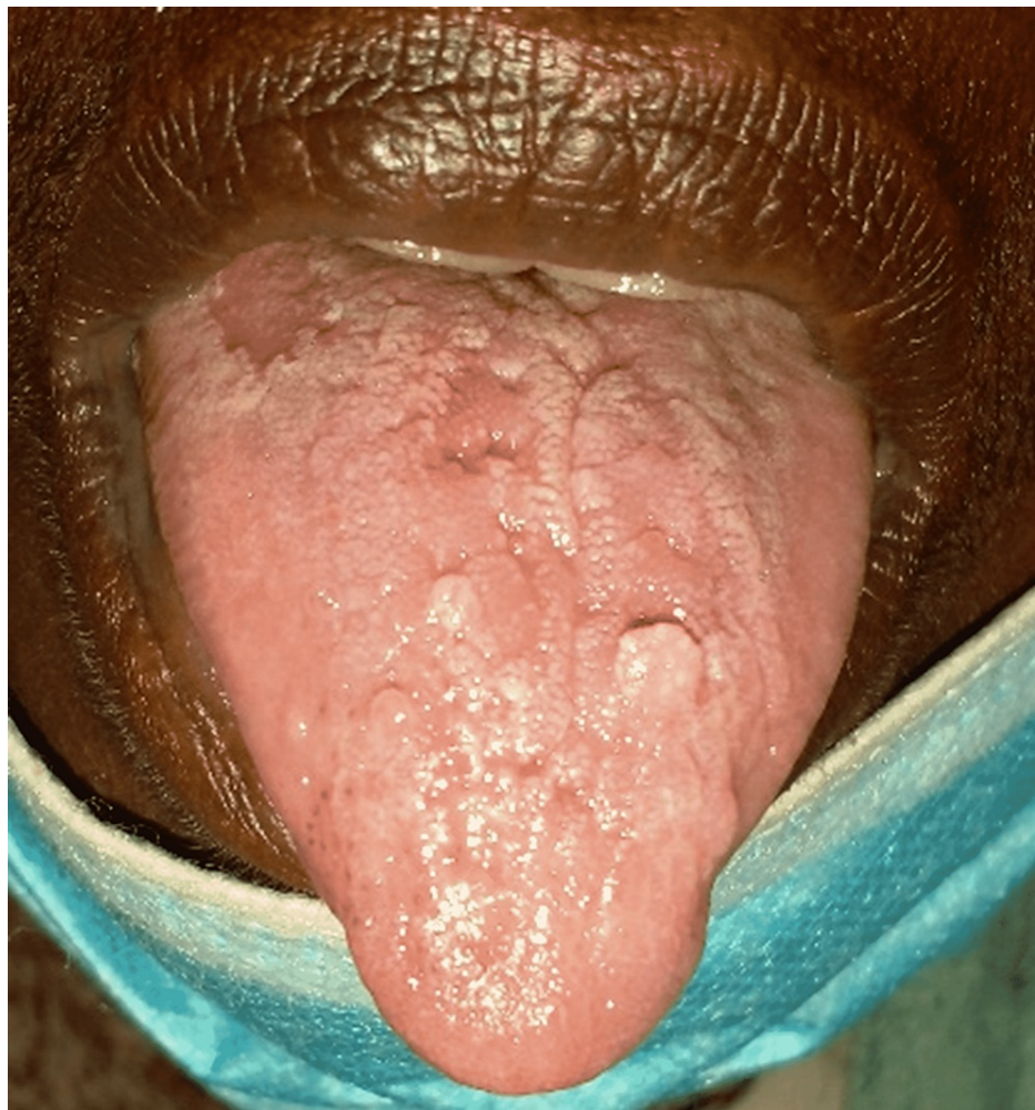
FIGURE 1: Tongue ulcerations

negative primary SS (pSS) was made. Consequently, the patient was commenced on prednisolone for three months with gradual tapering and azathioprine 50 mg once daily.