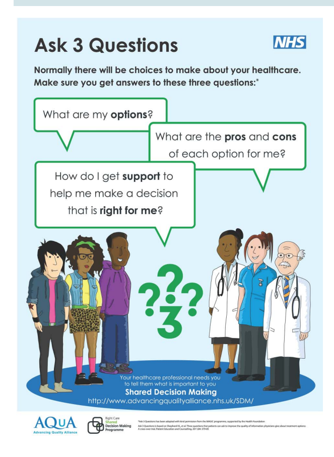
Figure 1 Ask 3 Questions (reproduced by kind permission of Advancing Quality Alliance).

knowledge and skills is justified. Some are prone to misrepresentation—accidentally or otherwise, this is readily identified through discussion and the underlying issues can then be addressed. The questionnaires also prompt appropriate engagement over potentially difficult issues such as sex and psychosocial concerns. Any issues that may arise are carefully addressed prior to transfer to adult services.