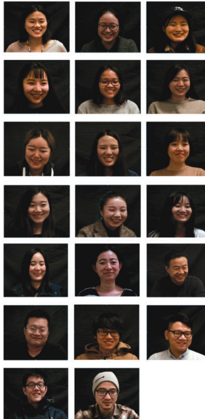
Figure 1. Images of East Asians used as stimuli in the perception test. Subject numbers of Caucasian expressers whose images were used as stimuli are listed in Note 2.

Note: Please refer to the online version of the article to view the figures in colour.