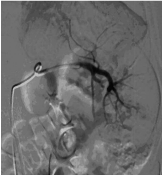
FIGURE 2. Splenic angiography obtained after the selective embolization with Bead Block microspheres (diameter range, 700-900 \mu\text{m} ) via a Progreat 2.8 Fr microcatheter shows a complete haemostasis. No extravasation is seen.

acute splenic injuries. It enables the classification of the splenic injury according to severity, for which the Organ Injury Scale for the spleen (American Association for the Surgery of Trauma-AAST) is a widely accepted grading system. 4,6 The scale is as follows: Grade I – subcapsular haematoma of less than 10% of surface area or capsular tear of less than 1 cm in depth; Grade II – subcapsular haematoma of 10–50% of surface area or intraparen-