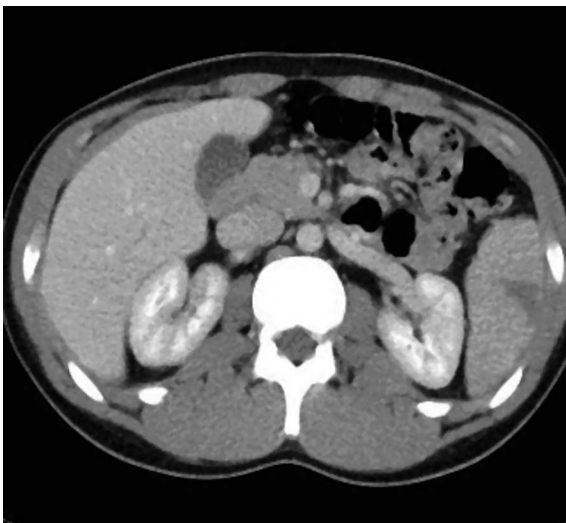
FIGURE 3. Transverse CT scan, obtained one month after the embolization shows small area of parenchymal infarct.

chymal haematoma of less than 5 cm in diameter or laceration of 1–3 cm in depth and not involving trabecular vessels; Grade III – subcapsular haematoma of greater than 50% of surface area (or expanding and ruptured subcapsular or parenchymal haematoma) or intraparenchymal haematoma of greater than 5 cm (or expanding) or laceration of greater than 3 cm in depth (or involving trabecular vessels); Grade IV – laceration involving segmental or hilar vessels with the devascularisation of more than 25% of the spleen; Grade V – shattered spleen or hilar vascular injury. Patients with AAST grade I or II splenic injuries and no associated splenic vascular injuries can be managed with just a simple observation. Those who are found to have one of the previously mentioned CT findings indicative of angioembolization – including AAST grade III–V splenic injury, active contrast extravasation or vascular injury of the spleen (pseudoaneurysm or A-V fistula) – should proceed to angiography and splenic embolization. 4,6