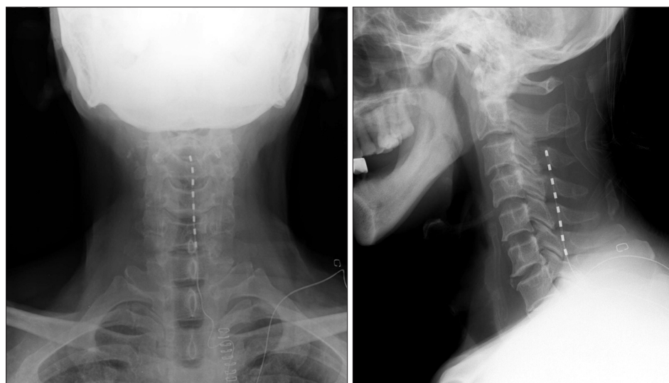
Fig. 1. The tip of electrode located at the 3rd cervical vertebral level.

After the spinal cord stimulation insertion, the ulcers on both hands began gradual recovery and were completely recovered after 6 months. The pain was maintained within 30/100 mm on VAS, and the use of opioid analgesics was decreased more than 50% compared with the pre-procedure stage (Fig. 2).