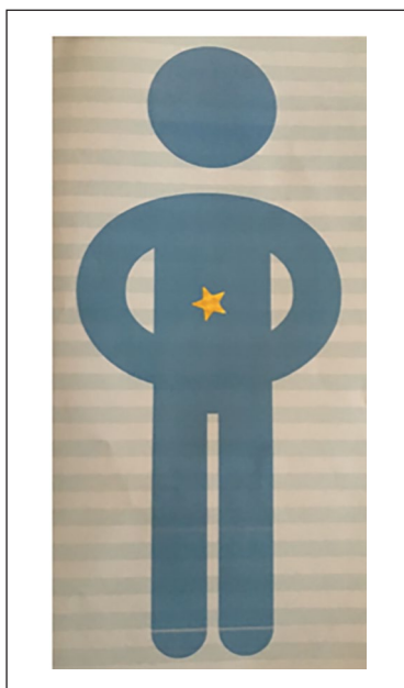
Figure 1. A younger child's description of their CFS/ME experience (Leo, KS1).