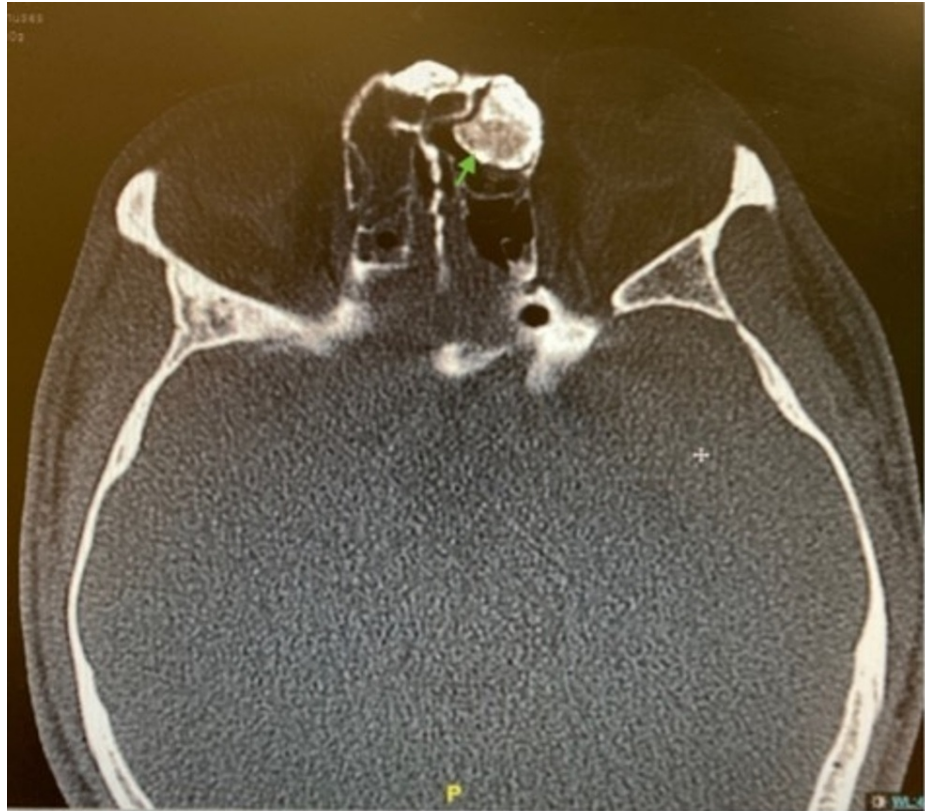
FIGURE 3: Axial view of the patient's CT PNS

The osteoma is indicated by the green arrow.