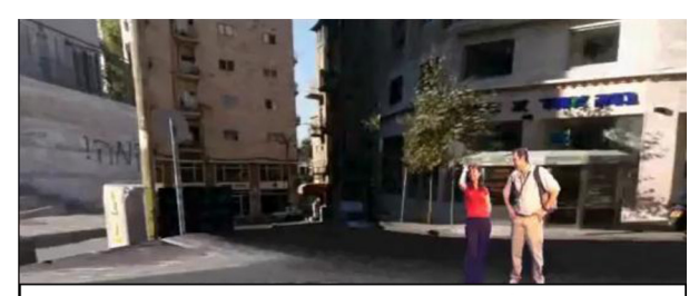
Sonarion Argaman client program can be viewed at :http://www.youtube.com/watch?v=QGNqlWeOilg, this specific movie display the reconstruction of Kikar-Tzion square in Jerusalem with two embedded actors