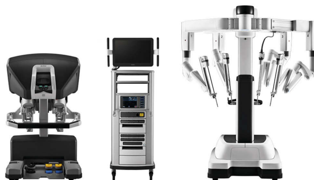
Figure 3 The da Vinci Surgical System® (Intuitive Surgical, Sunnyvale, California) robot. Image courtesy of Intuitive Surgical Inc. da Vinci Si System with single-site instrumentation. Surgeon console, surgeon, da Vinci® Si patient cart with Single-Site™ instruments. Available from: https://www.intuitivesurgical.com/company/media/images/singlesite.php . Accessed September 22, 2019. Copyright © 2019 Intuitive Surgical, Inc. 64

The da Vinci has a relatively larger setup compared to other robots used in spinal surgery. The robot's components comprise a booth where the surgeon sits and operates, an instrument and camera cart, a vision cart to which