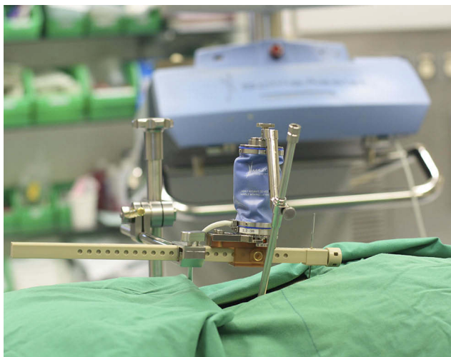
Figure 1 Following the pre-operative CT, the SpineAssist robotic platform is attached to the spine for final image registration.

Finally, screws are placed using the guide wires. The robot hardware is then disassembled and removed from over the patient. 3,56 This workflow is displayed in Figure 2.