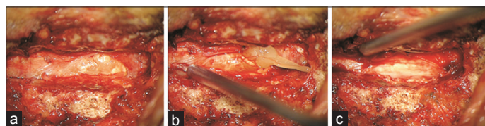
Figure 2: (a) Intraoperative photograph showing a cervical extradural ganglion cyst with severe cord compression. (b) The cyst contains gelatinous material. (c) After complete excision of the cyst, the spinal cord is well decompressed.