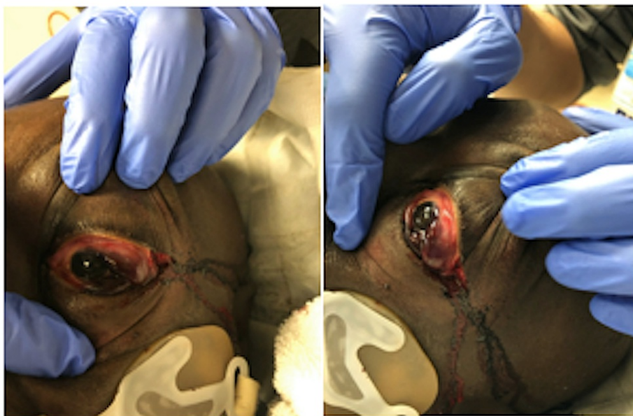
FIGURE 1: Post canthotomy (A) frontal view (B) lateral view

underwent CT imaging of the brain which demonstrated soft tissue swelling of the left orbital region without evidence of retro bulbar hematoma (Figure 2). The patient was admitted to the medical intensive care unit for stabilization and later transferred to a tertiary care center for further ophthalmologic evaluation.