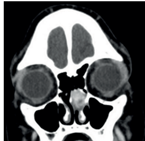
FIGURE 2: A head CT with contrast demonstrating an LCH in the left nasal cavity.

was noted to arise from the left lateral nasal wall anterior to the middle turbinate. Her surgery and recovery were uncomplicated and no recurrence has been noted to date, more than three years after her surgery. The final pathology was capillary hemangioma.