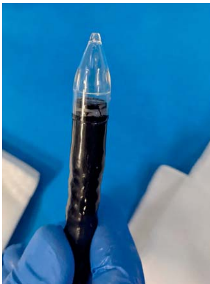
► Fig. 2 The 12 mm BougieCap device (Ovesco, Tübingen, Germany) attached to a GIF-HQ190 gastroscopie tip (outer diameter 9.9 mm; Olympus, Tokyo, Japan).

Bougies and balloons are two instruments commonly used for endoscopic dilation of benign strictures in the upper gastrointestinal tract, with similar efficacy [1]. However, these invasive strategies do not allow visual control of the operation during dilation of the stricture, and bleeding caused by the treat-