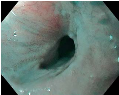
► Fig. 1 Endoscopic view of the stricture in the lower third of the esophagus (narrow-band imaging).