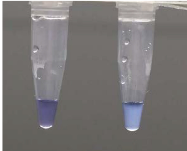
Fig 1. HtLAMP colour change associated with hydroxynaphtholblue (HNB). Left clear, purple colour = negative and right cloudy, blue colour = positive.