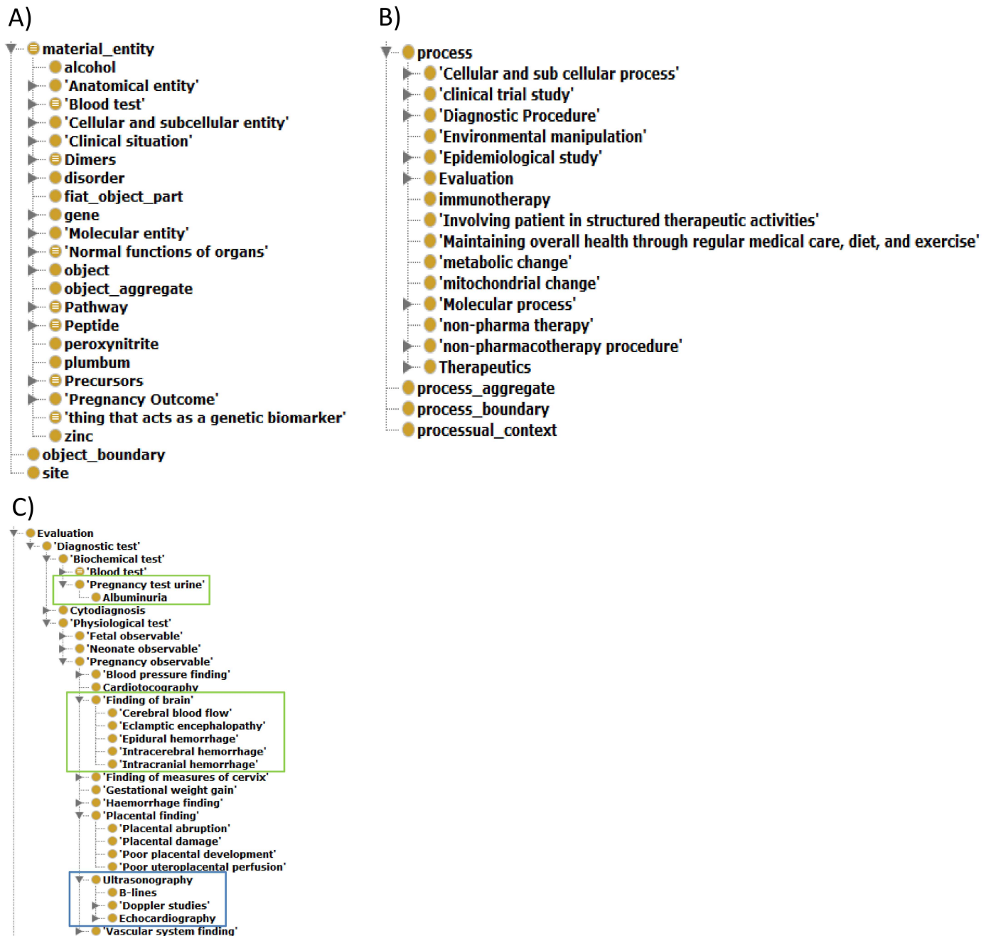
Fig 3. Hierarchy of terminology in PEO. (A) Hierarchy of terminological super classes about objects. (B) Hierarchy of terminological super classes about processes. (C) Examples of PE-specific terminology. Terms in blue box are gynecology-specific such as “Ultrasonography”. Terms in green box are PE-specific such as “Pregnancy test urine” and “Finding of brain”.