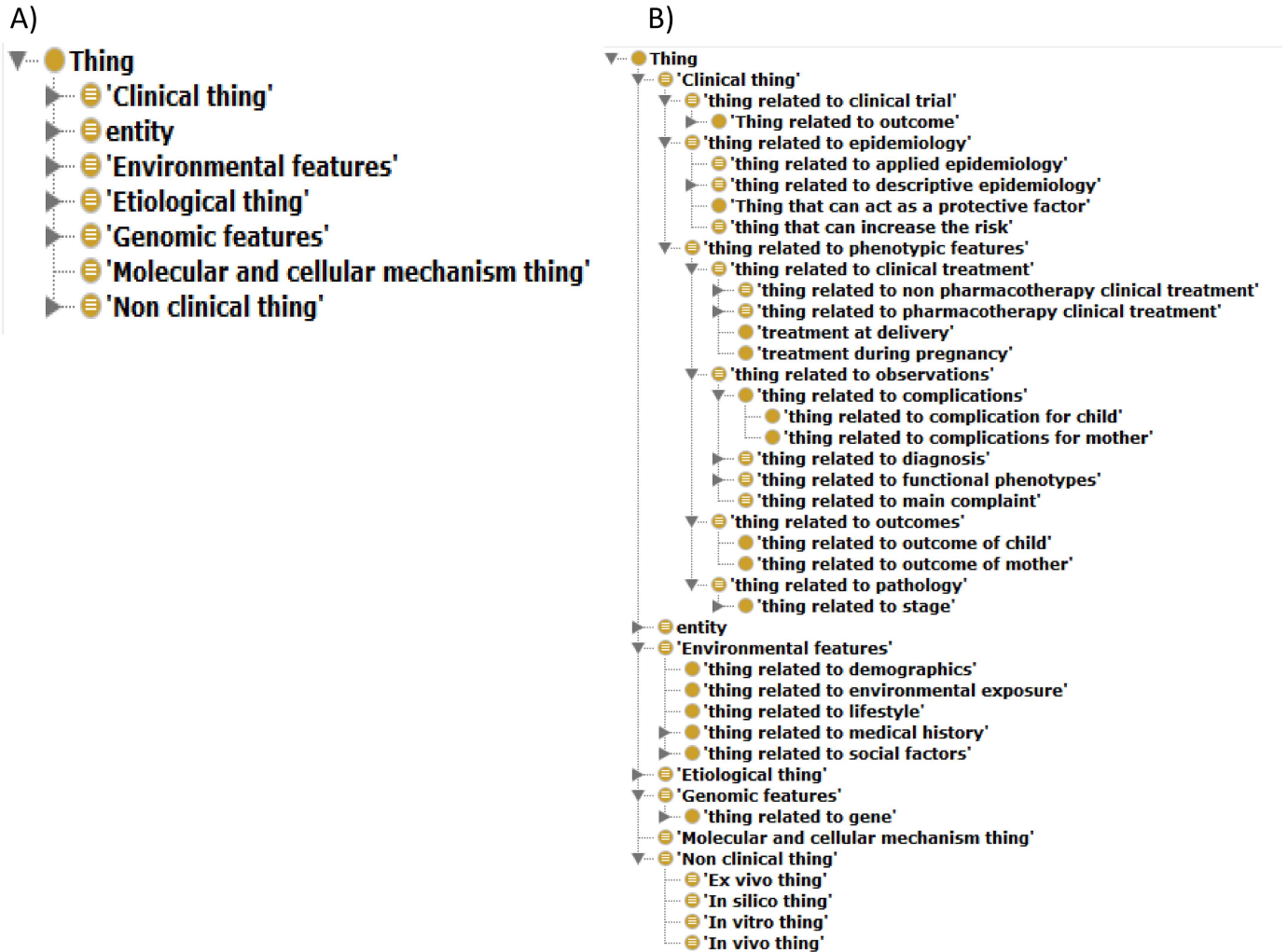
Fig 2. Hierarchy of concepts in PEO. (A) Root concepts in PEO. Root concepts consist of “Clinical”, “Nonclinical”, “Etiological”, “Molecular and cellular mechanism”, “Genomic features” and “Environmental features”. (B) Extracted concepts tree in PEO. PE-specific concepts such as “Thing related to complication of child” and “Thing related to complication of mother” were implemented.