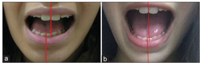
Figure 1: (a) Patient with intense right temporomandibular joint pain and mouth opening limitation to 12 mm with right deviation. (b) Patient after temporomandibular joint arthrocentesis and viscosupplementation with 36 mm mouth opening and partial correction of mouth deviation

As previously described in the literature, TMJ arthrocentesis is an effective treatment for acute DD without reduction, reducing pain and limited mouth opening. [8,19,25,26] However, disc repositioning does not seem to play a major role since many authors report clinical success without changing disc position. [24] Many