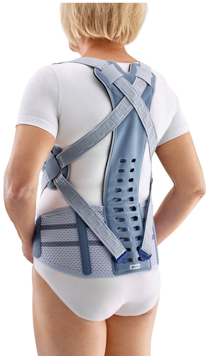
Figure 2 The Spinova Osteo—actively straightening back orthosis for stabilisation of the spine in case of osteoporosis (Bauerfeind Benelux).

the entire follow-up period. The latter will include up to 588 follow-up moments with six observations per patient. Based on the number of annual patients presenting with an OVCF at participating centres (table 3), it should be possible to recruit the required number of patients within 2 years.