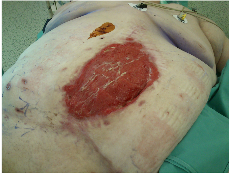
Figure 3 Finalization of NPWT treatment. Patient 3, overgranulated wound prepared for split skin grafting.

26 cm × 25 cm with practically no material for reconstruction. After component separation we used a sublay Parietene 3020 dual sided mesh (Covidien, Dublin, Ireland) over which we applied NPWT (Vivano, PAUL HARTMANN AG, Germany). 2 nd generation cephalosporin was administered as a prophylactic treatment; this was discontinued on day 8 after initialization of the therapy. After 8 dressing changes we ended NPWT treatment and applied split skin graft. The wound healed without complications and the patient has a good quality of life (good self-care, perfect mobility, occasional use of painkillers).