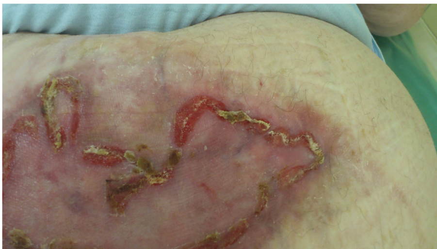
Figure 4 Split skin grafting. Patient 3, state after split skin grafting.

A 62-years-old woman with a height of 160 cm and a weight of 164 kg was admitted because of suspected tumor of the gallbladder. The operation was performed through the previous hernia sacs in medial laparotomy. In postoperative course the dehiscence of the wound occurred. This happened with the loss of domain formation after necrotization of the edges of the abdominal wall. After necrectomy a defect of approximately 45 cm × 30 cm opened. For reconstruction we used two pieces of sublay dual sided mesh Parietene 3020 (Covidien, Dublin, Ireland) and supported granulation tissue formation with the use of NPWT