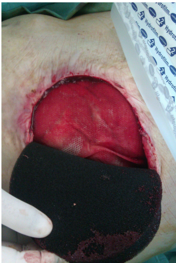
Figure 2 Application and redress of NPWT. Patient 2, progress of mesh overgranulation.

fasciitis. He plunged into massive sepsis with multiple organ dysfunction syndrome. With necessary necrectomy the patient ended with the defect in the abdominal wall sized 55 cm × 18 cm. Together with systemic intensive organ support we provided the defect with two Parietene 3020 dual sided meshes (Covidien, Dublin, Ireland) (sized 30 × 20 cm) sublay laterally to the lumbar region. We applied negative pressure wound therapy on the mesh (VAC ATS, KCI, Texas). Patient was hospitalized in anesthesiology department, with intensive organ support, artificial ventilation, and circulatory support with nor-adrenalin. Antibiotic therapy with combination of cephalosporins, quinolones, metronidazole was administered, at the time of initiation of NPWT changed to carbapenems. Meropenem was discontinued on 12 th day after initiation of NPWT. 4 weeks after initiation of treatment the patient underwent split skin grafting. During this time patient recovered from sepsis and MODS and was released from the hospital. He had no wound complications in the outpatient setting and no need for further surgery arisen. His quality of life is characterized by good mobility and self-care, appropriate adjustment for everyday work, and occasional use of painkillers.