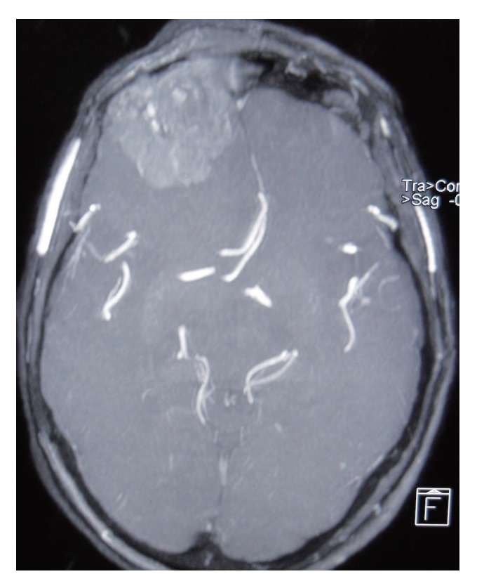
Fig. 1. Magnetic resonance imaging of the head showing an extra-axial mass.

The systemic evaluation required to make the diagnosis of solitary plasmacytoma included routine blood tests, serum calcium level and serum immunoglobulin levels, which were all normal. No Bence-Jones protein was detected in the urine. Bone marrow aspirate was unremarkable with normal morphological appearance and no bone marrow plasmacytosis. Computed tomography scan of the chest and abdomen showed no evidence of disease. A skeletal survey revealed no evidence of other bone lesions and bone scintigraphy showed