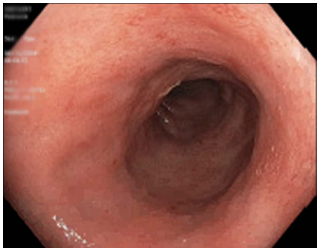
Figure 1. Image of the sigmoid colon revealing the areas of erythematous mucous.

presentation, his immunosuppressive regimen consisted of mycophenolate mofetil 500 mg twice daily, cyclosporine 100 mg twice daily, and ursodiol 300 mg twice daily. The patient endorsed taking only half of the prescribed dosage because of a miscommunication. No stool studies were performed because the patient's chronic diarrhea was thought to be due to causes other than infection. However, bulking agents were prescribed, which improved the patient's diarrhea, and endoscopic evaluation was scheduled for 1 month later.