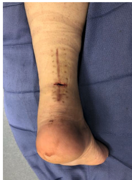
FIGURE 2: Intraoperative photograph of open rerupture of the achilles tendon. Axis of the wound is transverse and perpendicular to the original surgical incision.

By postoperative week 12, the patient’s skin had completely healed, and he was ambulating without his pneu-