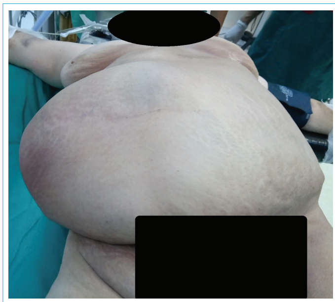
Figure 1. Giant incisional hernia.

The operations were performed under general, spinal or epidural anesthesia. Single-dose intravenous antibiotics (1 st generation cephalosporins) prophylaxis before the incision was applied. The skin scar from the previous operation was excised and subcutaneous dissection was performed until the intact fascia appeared. Hernia sac resected in suitable patients. The surgical site was washed with saline and aspirated, bleeding control was performed, and gloves were changed with the new pairs before mesh fixation. Mesh size was chosen according to the hernia size. Mesh was placed on the anterior sheath of the rectus muscle and was fixed with 2-0 prolene sutures after the fascia closure with 1/0 no prolene suture in onlay repair (Fig. 3). Mesh was placed between the anterior sheath and rectus muscle in inlay repair. Same type of mesh (polypropylene) was used in both groups. A double-sided hemovac drain was placed on the mesh and kept in place until the daily drainage was below 25 ml.