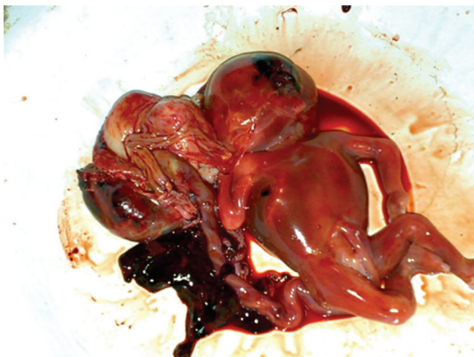
FIGURE 3: Fetus with placenta.