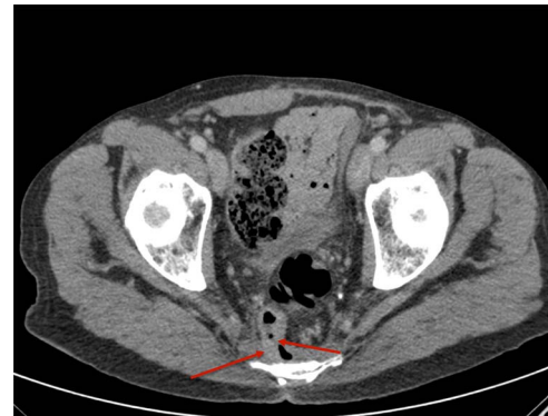
Figure 1. Axial section of contrast-enhanced CT (CECT) shows the communication of rectum to presacral collection at anastomotic site.

Flexible sigmoidoscopy showed no significant changes other than a previous anterior resection. His blood tests during this time showed normal leukocyte counts and a mildly elevated C-reactive protein that ranged from 16 to 29. Three CT scans of his abdomen and pelvis were arranged before referral to us. The initial CT in July 2017 showed presacral soft tissue thickening with air pockets that were in keeping with typical postsurgical changes. However, unusually, this presacral collection became more prominent in subsequent CT scans. By the time of his third CT in late 2018, a fistula between the rectum and the presacral collection at the anastomotic site could be identified (Fig. 1), suggesting a longstanding anastomotic leak. Multiple sinus tracts were also seen on this CT scan.