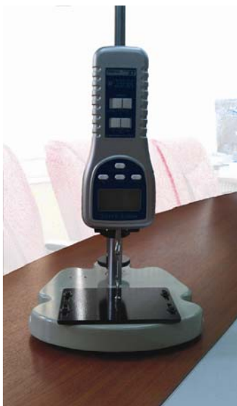
Figure 2. Digital force gauge and its stand.

(FD: force degradation, IF: initial force, FT: force at specific time interval).