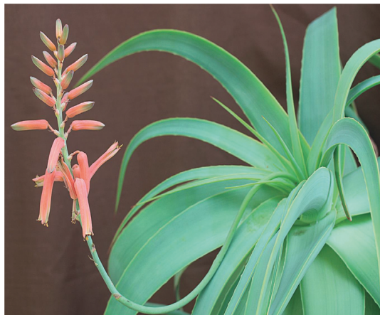
FIGURE 1: Picture of Aloe pulcherrima .

compounds including chrysophanol, aloesaponarin, nataloin, and 7-hydroxyaloin were isolated from the plant and showed antibacterial, antifungal, and antimalarial effects [18, 19]. The leaf latex of Aloe pulcherrima was found to be safe up to 5000 mg/kg in mice [18]. The leaf latex of the plant has been used in folk medicine to treat diabetes mellitus without scientific studies [20, 21]. Therefore, the current study was conducted to investigate antidiabetic activity of the leaf latex of plant.