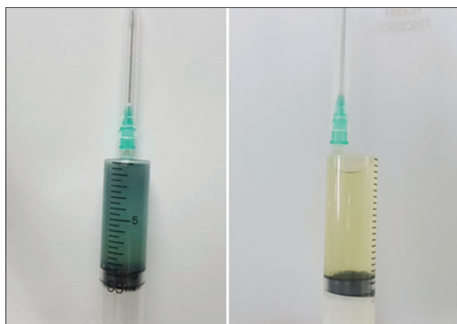
Figure 1: Sodium dithionite test on admission (on the left) and after the first hemodialysis (on the right)