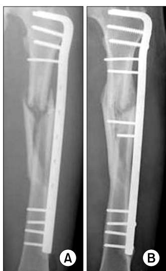
Fig. 2. Preoperative and postoperative X-ray of one nonunion patient. The postoperative X-ray shows that a callus had formed and union was achieved.

Many authors reported that the incidence of osteonecrosis of the femoral head is high among HIV-infected patients. For example, Miller et al. 2) evaluated the prevalence of osteonecrosis of the femoral head using MRI in 339 asymptomatic HIV-infected patients and 118 non-infected people who were matched for age and gender. In that study, osteonecrosis was diagnosed in 4.4% of HIV-