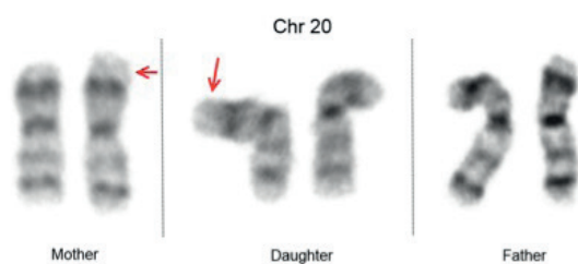
Figure 2. The comparison of mother's, daughter's and father's chromosome 20. The red arrow indicates the slightly enlarged region where the material of chromosome 17 is present.

In the second case, postnatal karyotype analysis carried out on lymphocytes was considered normal (46, XY). Furthermore, SNP array analysis (Figure 3) revealed a duplication of 14.9 Mb in the 4p16.3p15.33 regions and a deletion of 14 Mb in the 4q34.2q35.2 regions. The parents refused to be submitted to analysis.