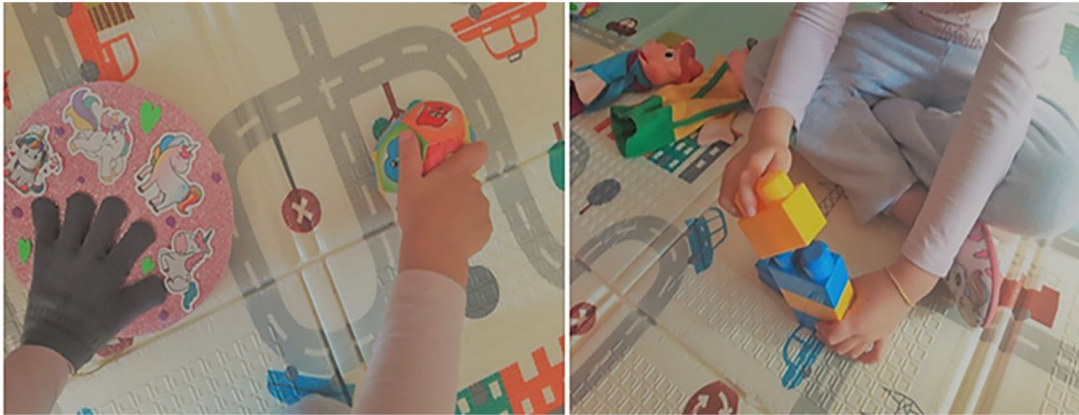
Figure 2. Both pictures show a child with right USCP. The first picture shows a mCIMT activity: the child must throw the small ball with the affected hand (right) while the unaffected hand is contained (left hand). The second picture observes the child performing a BIT activity: the child must assemble and disassemble Lego bricks using both hands, where the affected hand has the operating role, and the unaffected hand is assisting. BIT, bimanual intensive therapy; mCIMT, modified constraint induced movement therapy; USCP, unilateral spastic cerebral palsy.

conducted at the end of the treatment, that is, in week 10 (a total dose of 100h). The satisfaction and expectations questionnaire data were collected in two assessment timepoints: week 0 and week 10. There was a post-treatment follow up at week 34. The assessment timepoints are shown in Figure 3.