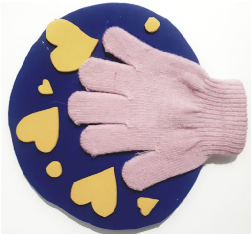
Figure 1. Partial unaffected hand containment.

changing to act as the operating hand in the last 4 weeks. For the 2 weeks of BIT in the mCIMT-B program, the affected hand was given the assisting role for the first week, and then the operating role for the second week. Some examples of activities for both therapies are shown in Table 1 and Figure 2.