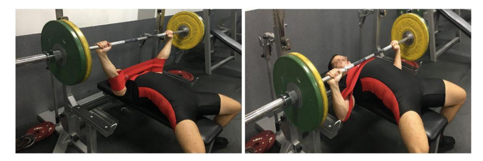
Figure 2. SS placement during a sample flat bench press repetition. Participants were instructed to wear the SS sleeve in the middle of the elbows.

The main experimental protocols were conducted at the same time of the day to avoid the effects of circadian rhythm on bench press results. Two testing sessions (CONT and SS) were used for the experimental trials and completed by each participant. The same warm-up protocol was adopted, and an identical rack height and grip width was implemented. All participants performed single bench press attempts alternatively with or without the SS (Figure 2), with the external loads (70%, 85%, and 100% 1RM evaluated during familiarization session), and 5 min rest intervals were allowed between successive attempts. Following the seven-day interval, the participants returned to the laboratory and completed consecutive trials.