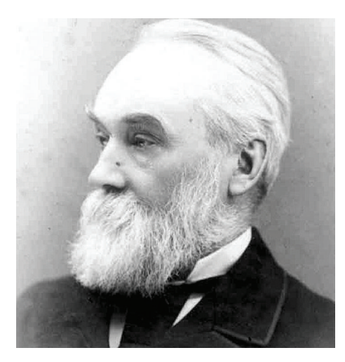
FIGURE 1: John Hughlings Jackson (1835–1911).

During the 1940s, important discoveries were made in the field of psychomotor epilepsy. Klüver (1897–1979), a German-American psychologist, and Bucy (1904–1992), an American neuropathologist, well known for the discovery of the