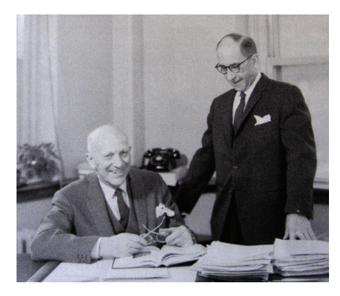
FIGURE 3: Wilder Penfield (1891–1976) on the right and Herbert Jasper (1906–1999) on the left.

2.3. The Patch-Clamp Technique. An important development in the field of neuroscience was that of Neher (1944-), who invented the patch-clamp method to measure the flow of current through single-ion channels [82]. Neher and Sakmann developed the patch-clamp technique for which in 1992 they received the Nobel Prize [83]. Using the patch-clump technique, the various ion channels were able to be studied and, thus, the role of calcium channels was clarified in epilepsy [84].