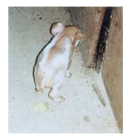
Fig. 1. Diarrhoea, dehydration and emaciation during acute isosporosis in a suckling piglet.

Histological examination revealed atrophy of the villi in different grades (often severe), especially in the medial and caudal jejunum and in the ileum, accompanied by mild crypt hyperplasia. The villi were reduced and frequently fused, covered with metaplastic, flat to cubic epithelium or with focal to multifocal loss of epithelium or necrosis. Occasionally, the superficial epithelium was covered with thin layers of fibrinous threads, detritus, inflammatory cells and bacteria. One piglet suffered from diphtheroid-necrotic enteritis. The lamina propria showed mild to moderate accumulation of mononuclear cells as well as a moderate to high focal to multifocal infiltration with neutrophilic and eosinophilic granulocytes. Mild oedema was found in some cases, and in one it was severe.