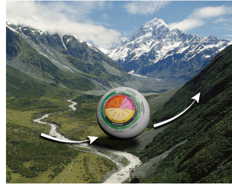
FIGURE 2: The Behavior Change Ball moving through a landscape. The proposed relationships between the theoretical concepts from the Behavior Change Ball are best illustrated by the metaphor of a ball moving through a landscape [49].

The framework is developed to capture and understand organizational behaviors (OBs) of local policy makers at strategic, tactical, and operational levels that are essential for integrated policy. Ten OBs are specified and related to capability, opportunity, and motivation (COM) and nine intervention functions and seven policy categories are formulated (Figure 1). Although the BCB framework in itself does not explain or predict OBs, it aims to capture obstacles that can explain variation in policy development. Therefore, the BCB was considered the most appropriate framework for the current study.