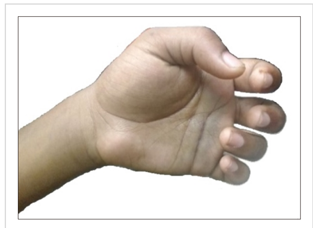
Fig. 1. Clawing of all fingers and bluish appearance of the palm (at presentation).

The radiograph images did not reveal any fractures. However, magnetic resonance imaging showed the presence of intra-articular collection in the wrist and neurovascular plane (Fig. 2). Thus, the administration of recombinant factor VIII twice daily was initiated (with a target of 50% correction). The opinion of an orthopedic surgeon was ob-