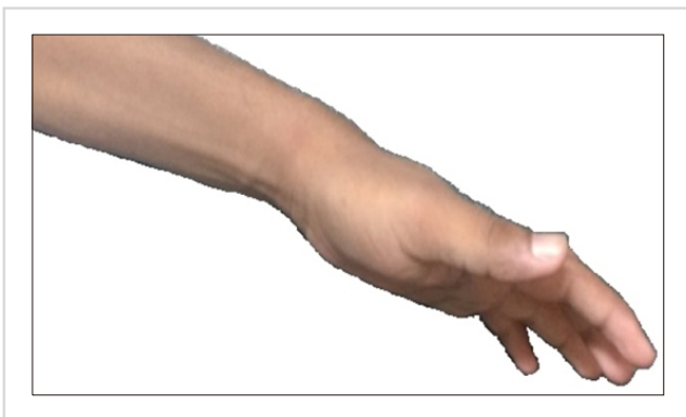
Fig. 3. With regular clotting factor replacement and physiotherapy, significant clinical improvement and movement in the small joints of the hand improved. No residual neurological deficit was observed after 4 weeks.

In the present case, the patient sustained a fall on the outstretched hand and developed swelling from the elbow up to the left hand. Soft tissue swelling and involvement of both the ulnar and median nerves were simultaneously observed at different sites, suggesting compartment syndrome. With conservative management only, a significant clinical improvement was observed after 1 week and almost a complete resolution after 3 weeks. In our case, continuous effort to achieve an effective hemostasis led to a significant result.