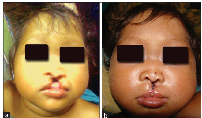
Figure 2: (a) Pre-operative left unilateral Median facial dysplasia cleft lip, (b) Post-operative view

Noordhoff and Cheng initially coined the term median facial dysgenesis, this term was later changed