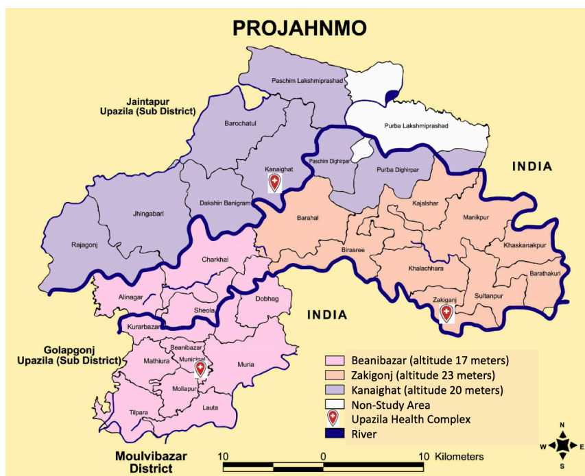
Figure 1 Projahnmo research foundation surveillance area.

Twenty-two CHWs were trained in September 2015 to use a Masimo Rad-5 pulse oximeter with an LNCS Y-I wrap sensor as a part of enhanced respiratory surveillance