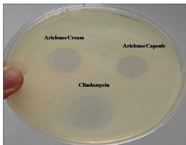
Figure 1: Zone of inhibition against Propionibacterium acne (at column width)

The zones of inhibition for AHPL/AYTOP/0213 cream and standard clindamycin were 20.68 mm and 26.80 mm, respectively. The A.I. for AHPL/AYTOP/0213 cream was 0.77 and percentage inhibition was found to be 77.19 [Figure 1].