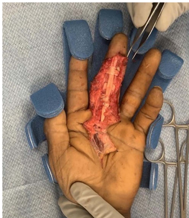
Figure 2. Intraoperative photograph demonstrates the annular 2 (A2) pulley reconstruction with autologous palmaris longus tendon and the annular 4 (A4) pulley reconstruction with autologous flexor digitorum superficialis tendon.

Six weeks postoperatively, the patient's flexion contracture of the left long finger PIP joint had fully resolved. Range