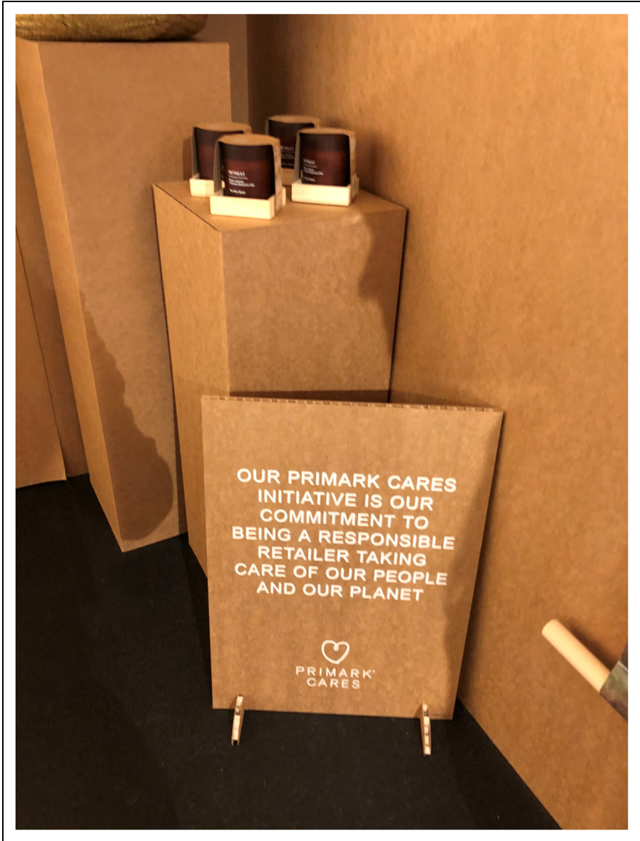
Figure 3. 'Primark cares' display.

Such extreme forms of carewashing did not simply arrive with the pandemic; they had been rehearsed beforehand. Just before the beginning of the pandemic, for example, Primark, a company that is emblematic of fast fashion and the throwaway consumer