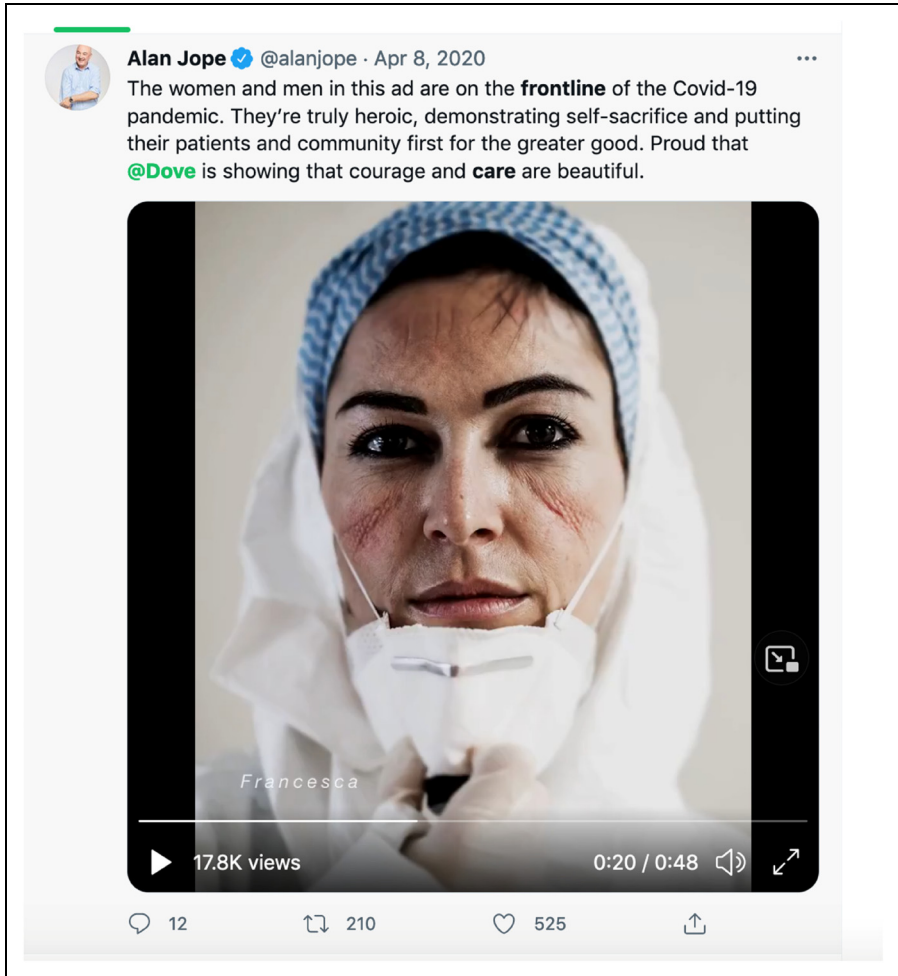
Figure 1. Still from a Dove TV advert, shared on Twitter by the CEO of Unilever.

The #WashToCare campaign launched during the pandemic can be understood in this context.