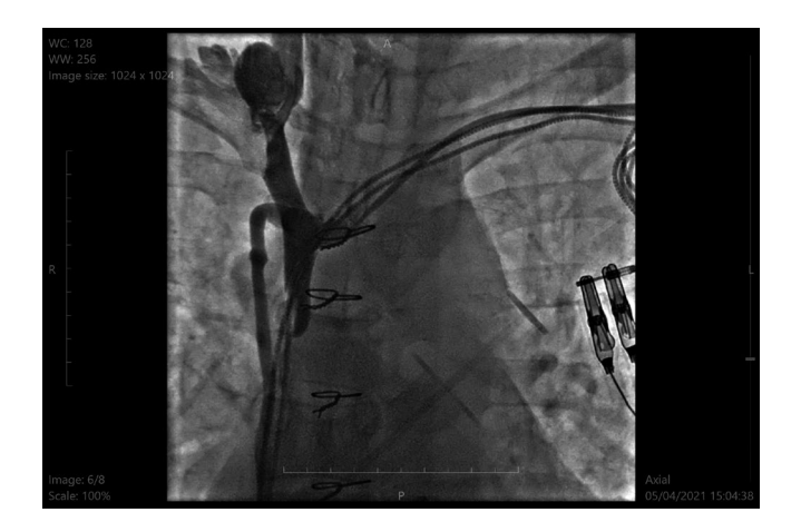
FIGURE 2 Trouble with inserting 0.035 Terumo hydrophilic guidewire to pass SVC obstruction

through the superior vena cava (SVC), the guidewire could not pass through the superior vena cava in spite of our encouraging to manipulate (Figure 2). A venogram was done and the obstruction SVC was confirmed (Figure 3). The site of obstructed SVC is just inferior to right brachiocephalic 3 cm and the length of obstructed SVC is about 4 cm. With little experience in these scenarios and without equipment like venous balloons, venous stents, and excimer laser sheaths during lead extraction in our institute, we consulted the coronary interventionist before consulting the cardiac surgery and tried to use Juking Right guiding catheter 6F and a 0.014 inch coronary wire (Asahi Sion Blue 0.014 \times 180 cm) without curve bending to pass through the obstruction, and fortunately, it was too easy in the first time. Our coronary interventionist used a small over-the-wire coronary balloon (3.0 \times 20 \text{ mm}) to dilate slowly, carefully, and gradually SVC with pressure ranging from 18 to 24 atm. We dilated the SVC four times, did a venogram again, and confirmed that the obstruction was resolved partly without any evidence of SVC perforation (contrast flowed slowly via SVC without contrast leaking-the contrast flowing via SVC is better). Rewiring through SVC by 0.035 Terumo hydrophilic guidewire was successful. We continuously inserted the long sheath (Medtronic 060037A Introducer Sheath 6Fr × 23 cm)