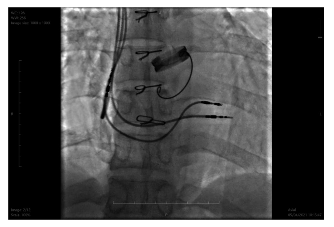
FIGURE 4 Final result—successfully implanting new RV lead on the low anterior septum RV

FIGURE 3 Venogram confirmed obstruction in SVC and collateral circulation in azygos vein