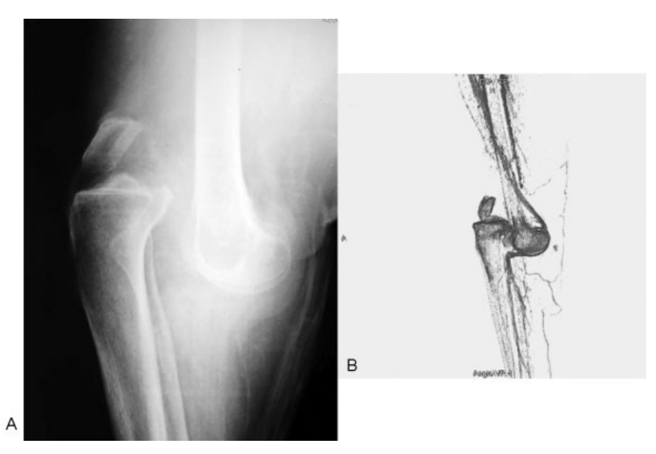
Fig. 2 Imaging at 2-year follow-up. (A) X-ray shows complete anterior dislocation of the tibia. (B) Computed tomography angiography documents the dislocation and the kinking of the popliteal vascular fascia in absence of significant distal stenosis.

At the clinical exam, the knee showed a severe multidirectional instability; the dislocation was irreducible, but the patient showed 90 degrees of knee flexion and full active extension, which confirmed the integrity of the extensor apparatus. There was tolerable pain, only during active extension.