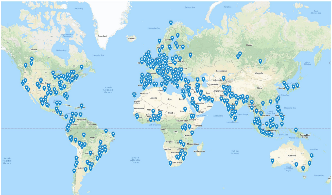
Fig. 2 Over 1400 registrants for the 2021 webinar on lipofilling in breast reconstruction by Roger Khouri (Miami, USA) and Andrzej Piatkowski de Grzymala (Maastricht, the Netherlands). Figure provided by Hinne Rakhorst

society meetings previously but the first stand-alone meeting has not occurred.