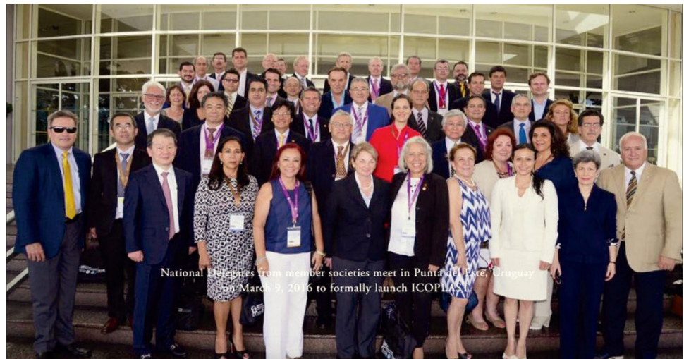
Fig. 1 National delegates from member societies meet in Punta del Este (Uruguay) to formally launch ICOPLAST

Each member country has a representative on the council of national delegates. This council is the ultimate governing body of the society to which the board of directors is accountable. The council of national delegates meets, at a minimum, at least yearly and with the COVID pandemic business has taken place on a zoom platform. Delegates are elected for a 4-year term which is renewable once. The council of delegates come together as a General Assembly which serves as a forum of communication with the individual members of the national societies, but the General Assembly itself has no voting rights or governance of power.